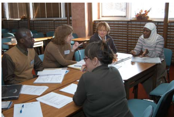
The ASPIRE Development Partnership have regular meetings to discuss innovations in empowering asylum seekers

And through demonstrating the success of pilot projects and services, the partnership's aim is to leave a legacy of best practice through influencing local, regional, and national policy makers.