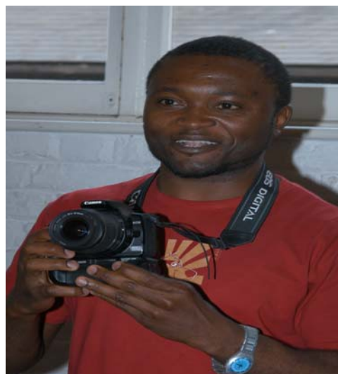
Beneficiary taking photos