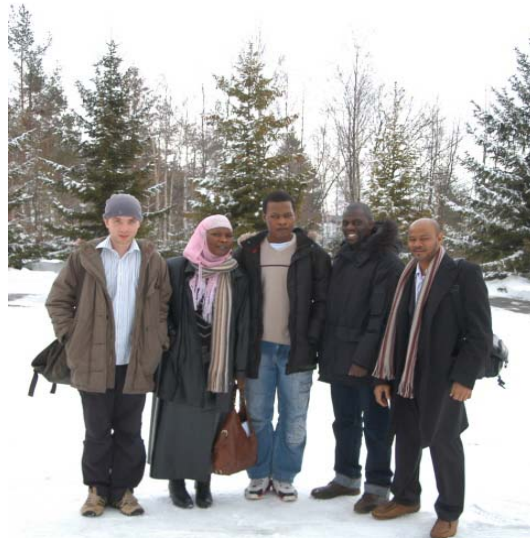
Members of the North London Development Partnership arriving in Stary Smokovec to take part in the Slovakian leg of the EQUAL conference.

In attendance were representatives from Holland, Estonia, Great Britain and, of course, Slovakia. Alongside the continuing discussions on best policy and repeated efforts to learn from the various experiences of the partners there were also presentations from the Dutch and British delegates outlining pioneering methods of learning that heighten the empowerment of asylum seekers and underline the necessity to develop innovation within the fields of training and education.