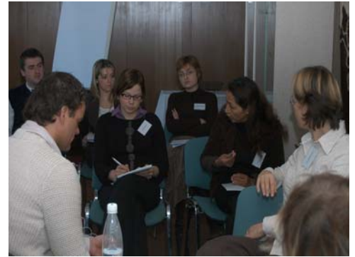
Dutch partners deliver a presentation on e-learning as innovation in services available to asylum seekers.

In February this year The North London ASPIRE Development Partnership attended a transnational conference in Slovakia to continue the ongoing work with European partners which improves the lives of Europe's asylum seekers, as well as raising awareness of the work and services offered to asylum seekers and maintaining the strong partnership between the countries who have been involved in the partnership for the past two years.