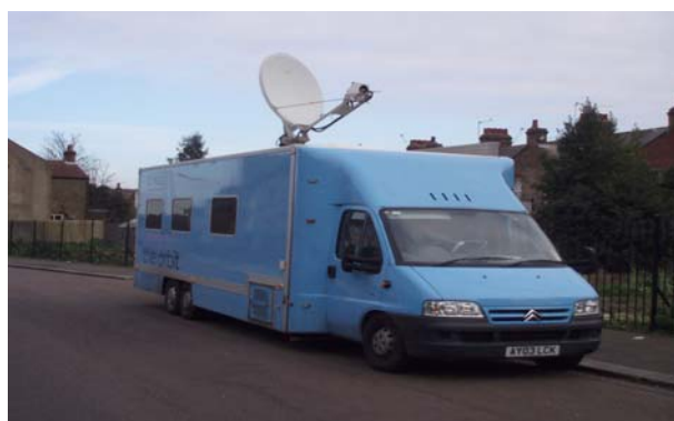
CoNEL's Orbit Bus is an innovative mobile IT suite that takes learning into the community