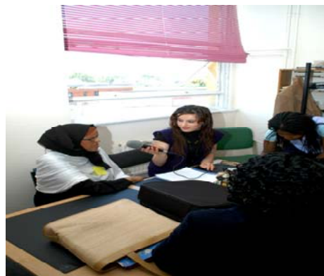
Beneficiaries conducting interviews for the radio

'...a good way of showing what Asylum Seekers can contribute to the society ...'