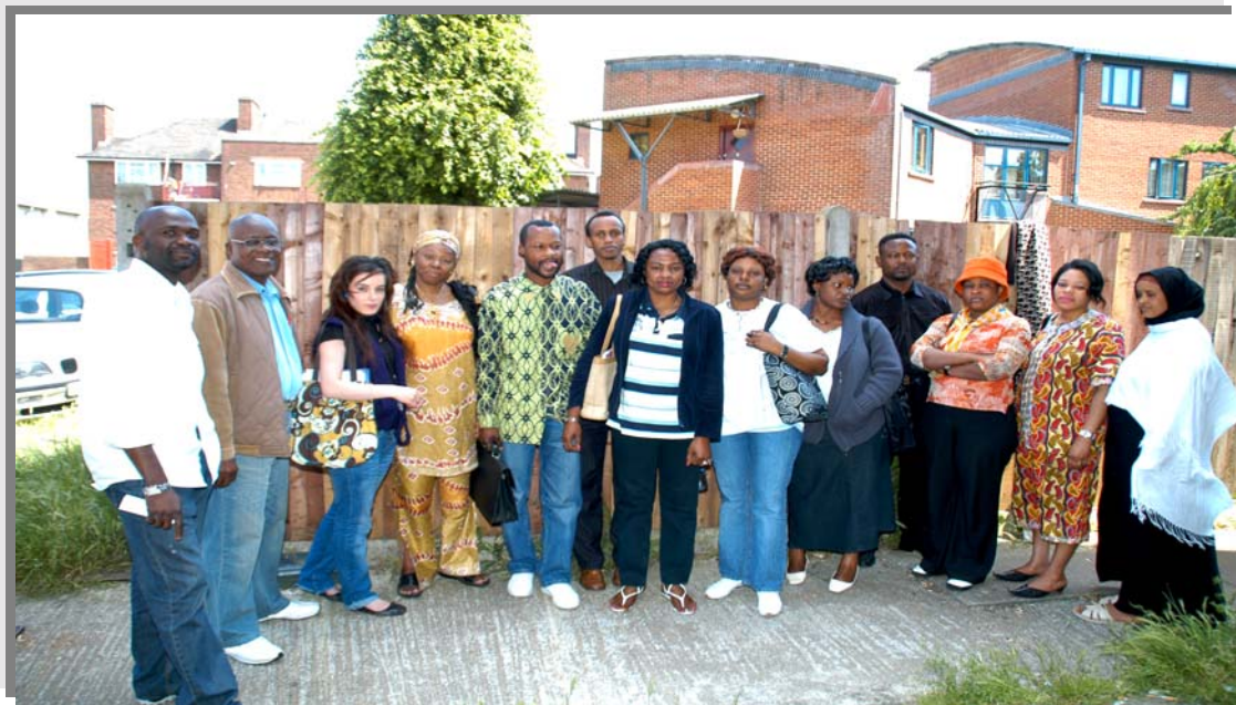
A cross section of ESOL Students at Selby Centre